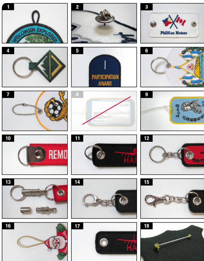
Images shown are to illustrate accessories, not emblem type.