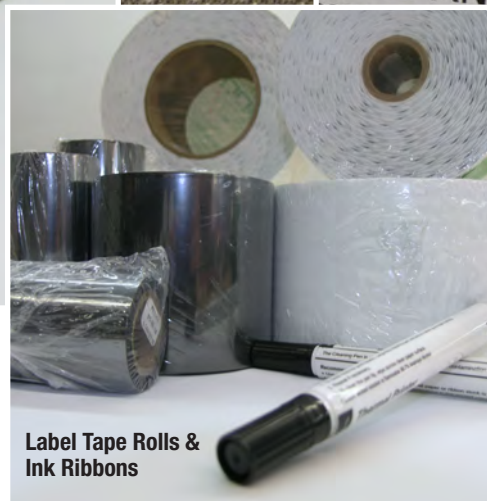
Label Tape Rolls & Ink Ribbons

Garment Identification Labels are primarily used to mark, identify, sort and track garments and linens within a laundry processing or textile manufacturing environment. They are commonly applied to uniforms; workwear; career wear; hospital garments; hospital and nursing home linens; nursing home resident garments; and hotel and restaurant linens.