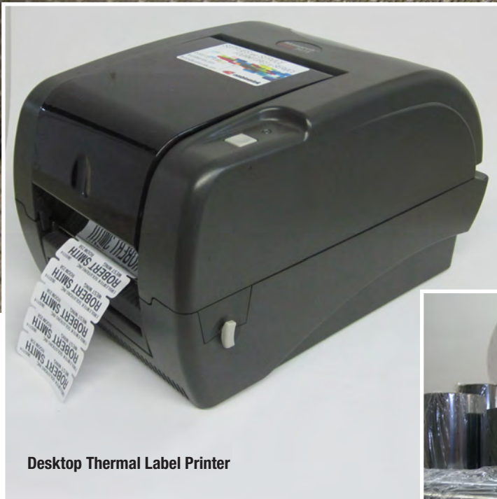
Desktop Thermal Label Printer

Colour Coding Dots are used to quickly mark or track garments and textiles by way of colour identification.