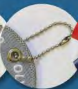
Grommet and Chain