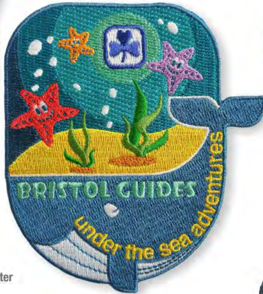
LowProfile® custom cut shapes