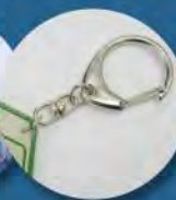
Swivel Clasp Hook