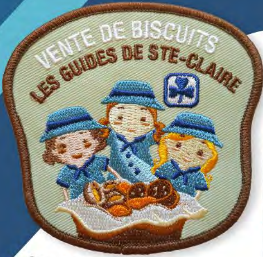
Custom with Merrow borders