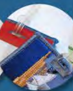
Plastic Strap & Sleeve luggage tag