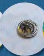
Butterfly Clutch Pin