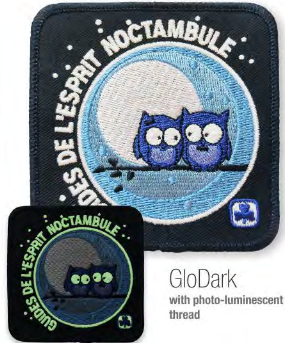
GloDark with photo-luminescent thread