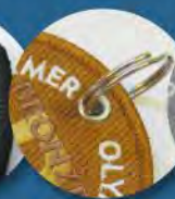
Grommet and Split-Ring