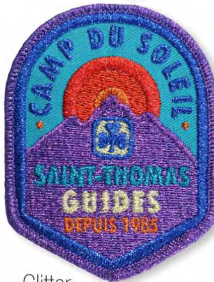
Glitter with metallic "glitter" threads