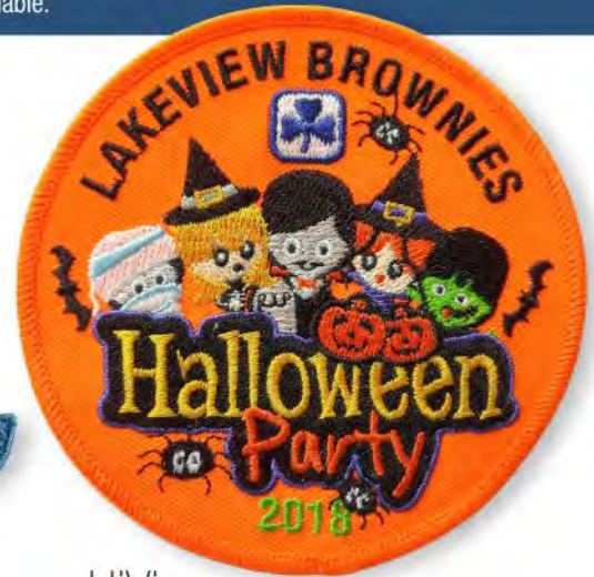
HiVis with high visibility fabric and threads