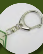
Swivel Clasp Hook