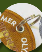
Grommet and Split-Ring