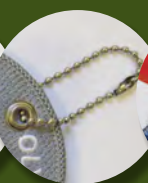
Grommet and Chain