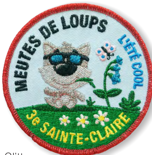
Glitter with metallic "glitter" threads