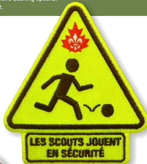
HiVis with high visibility fabric and threads