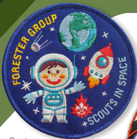
Custom with Merrow borders