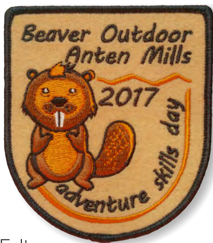
Felt with 100% polyester felt fabric