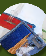
Plastic Strap & Sleeve luggage tag