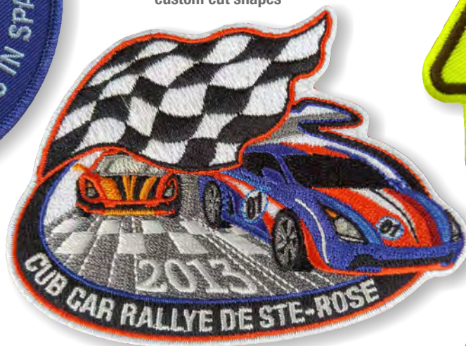
LowProfile® custom cut shapes