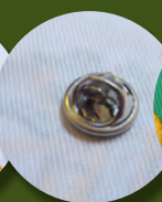
Butterfly Clutch Pin