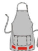
Bottom Left, Right, Center