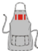
Chest Left, Right, Center