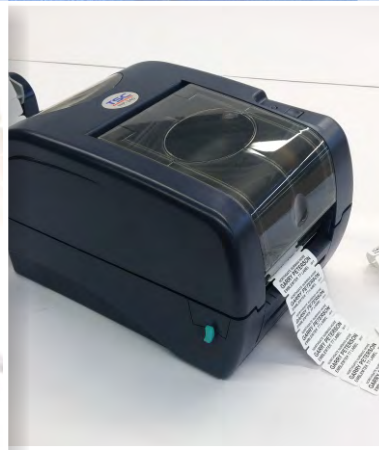
Desktop thermal label printer