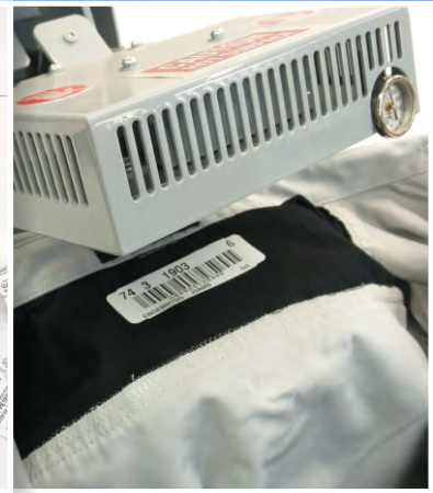
Heat Seal Machines