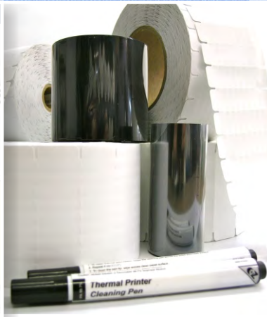
Label tape rolls & ink ribbons