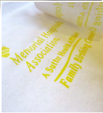
Light-weight tissue carrier