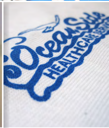
Laundry resistant indelible ink