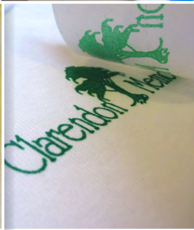
Heat seal application