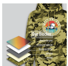
UltraTranz™ Dye Blocker